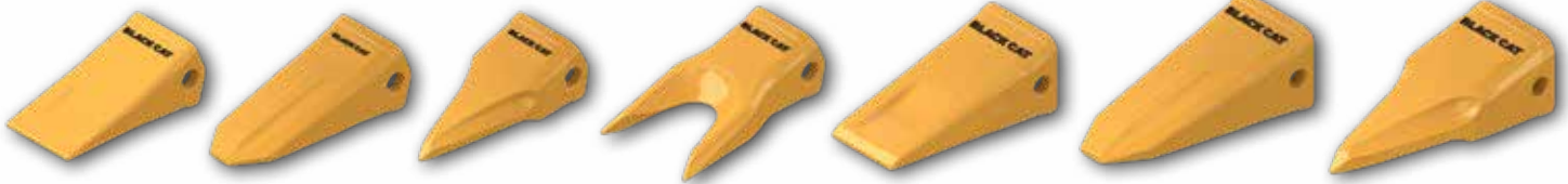
161-3027 161-3027 RC 161-3027 T 161-3027 WT 262-3046 262-3046 RC 262-3046 T